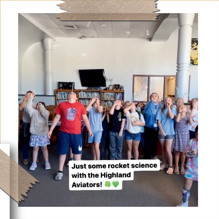
Just some rocket science with the Highland Aviators! 🍀💚